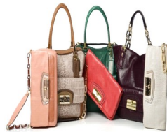
Style and color of bags will vary and may not be the ones pictured.

(if purchased in advance, $30 at the door)